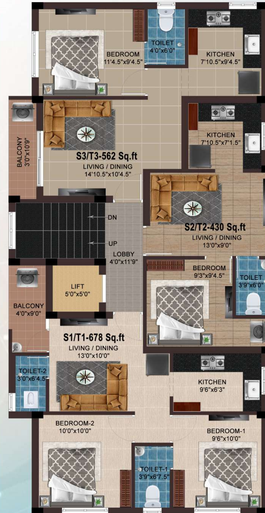
SECOND & THIRD FLOOR PLAN